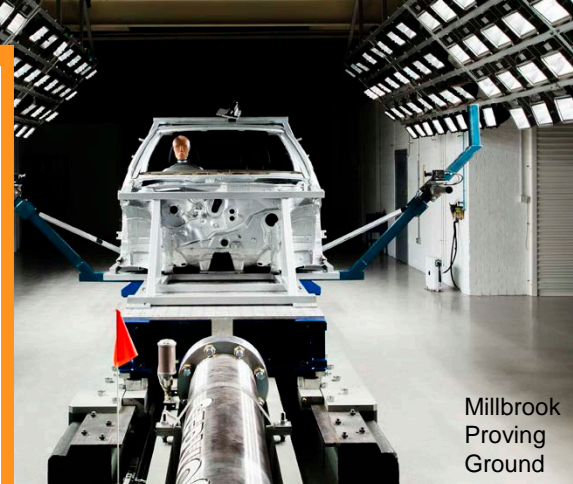
Millbrook Proving Ground