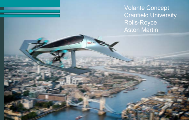
Volante Concept Cranfield University Rolls-Royce Aston Martin