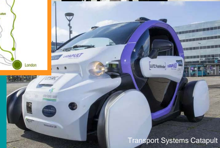
Transport Systems Catapult